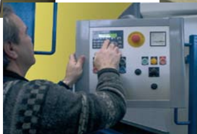
Electronic SEW servo controllers for precision synchronization of motor speeds, torques & drives.