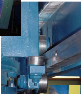
Precise maintenance-free roller guides